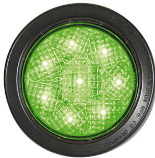
PM-1217G-R-426 flush mount