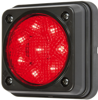
PM-1217G-R-417 surface mount